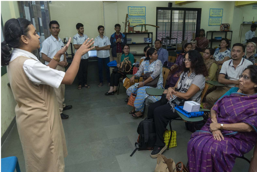
Student demonstration to the delegates at the Gifted Student Centre, Kaveri Group of Institutes