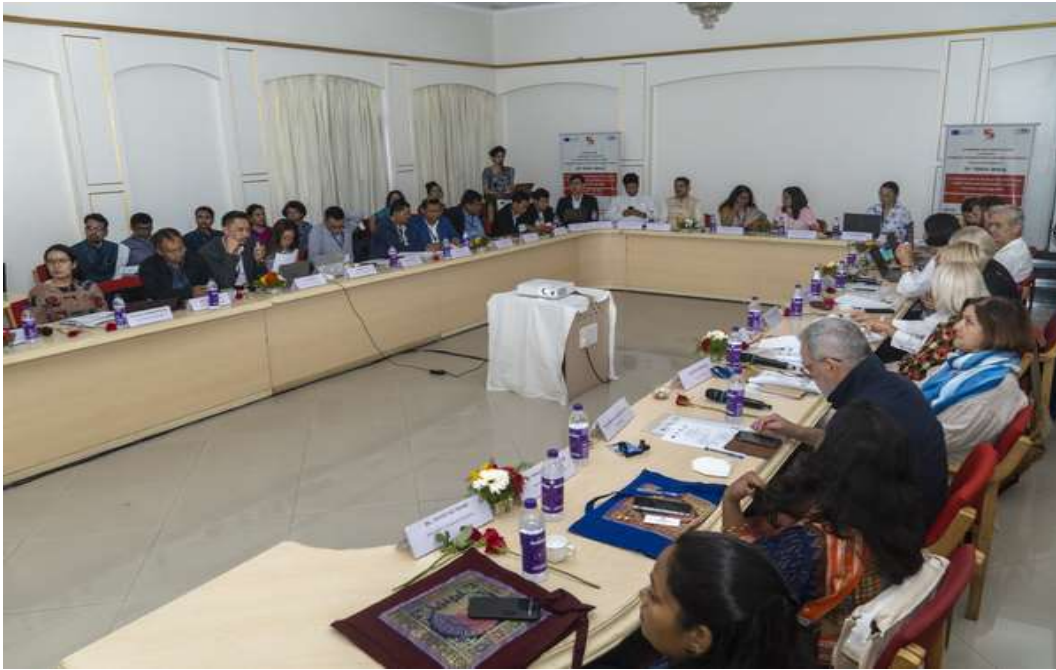
21st TS Delegates at the networking event with top management members of Symbiosis International (Deemed University)