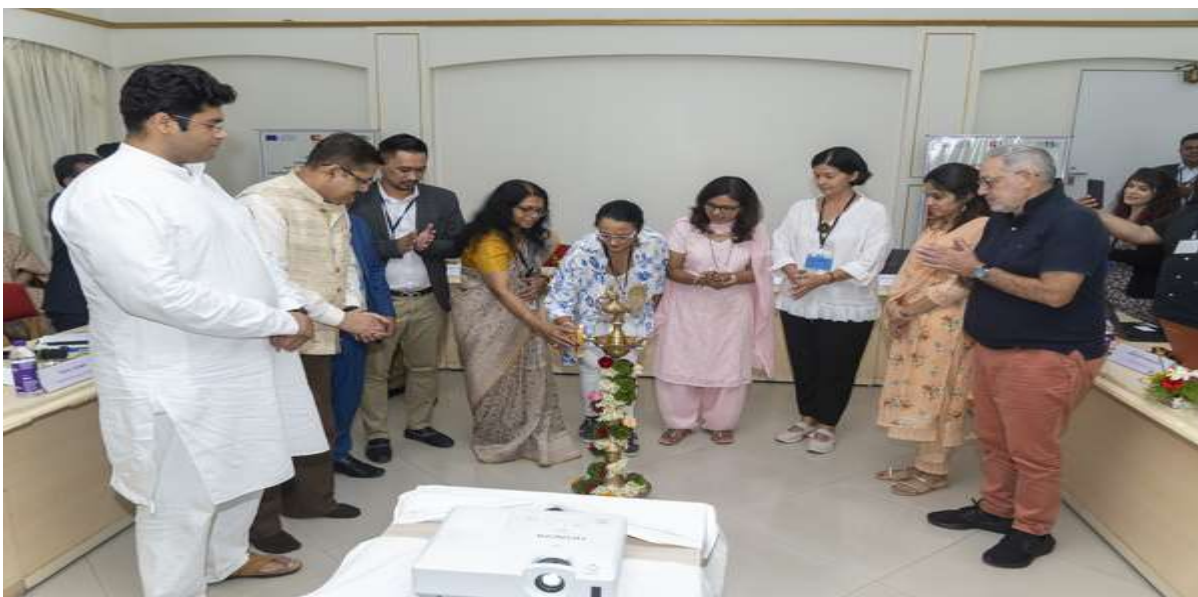
Inaugural ceremony: Lighting the lamp by project representatives of partner institutions